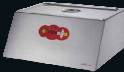
SOPHIE: 23 liters water bath 1/1 Gastronorm w x l x h (mm): 550 x 470 x 250 Power connection (V/Ph/kW): 230/1/1.4