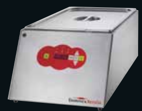
KERSTIN: 23 liters water bath 1/1 Gastronorm w x l x h (mm): 470 x 550 x 250 Power connection (V/Ph/kW): 230/1/1.4