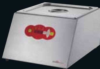
ARIANE: 14 liters water bath 2/3 Gastronorm w x l x h (mm): 380 x 470 x 250 Power connection (V/Ph/kW): 230/1/0.9