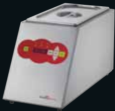
EMILY: 6 liters water bath 1/3 Gastronorm w x l x h (mm): 210 x 470 x 250 Power connection (V/Ph/kW): 230/1/0.5

Four different sizes are available, perfect for any application: To start with, as second appliance, for mobile use, for continuous operation, for small or large dishes. Full usage of the whole machine since it is heated from the outside. No disturbing elements in the machine which would reduce the volume or make cleaning difficult.